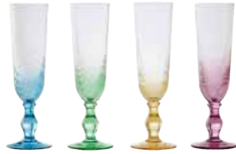
Champagne Flutes - Set of 4 2.25x2.25x8.5" / 8.5 oz ASD10003