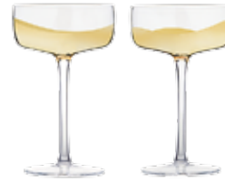
Champagne Coupes Gold - Set of 2 4×4×6.5" / 8.5 oz ASD10398