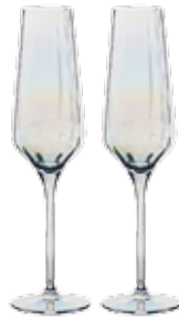
Champagne Flutes - Set of 2 2.5×2.5×10.75" / 10.25 oz ASD10298