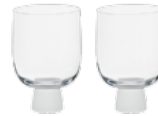
DOF Tumblers Frost - Set of 2 3x3x4.5" / 10.25 oz ASD10393