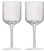
Wine Glasses - Set of 2 3×3×7" / 8.5oz ASD10195