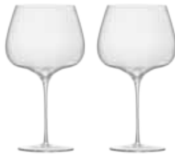
Gin Glasses - Set of 2 4.5x4.5x7.75" / 23.5oz ASD10416