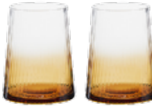
DOF Tumblers Amber - Set of 2