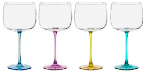
Gin Glasses - Set of 4