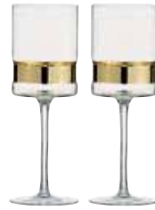
Wine Glasses Gold - Set of 2