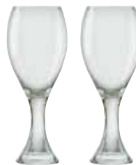
Red Wine Glasses - Set of 2