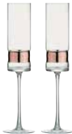
Champagne Flutes Bronze - Set of 2