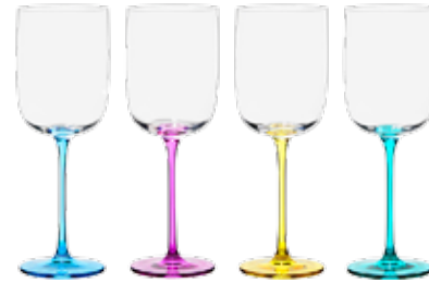
Wine Glasses - Set of 4