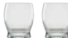
DOF Tumblers - Set of 2