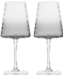
Wine Glasses Smoke - Set of 2