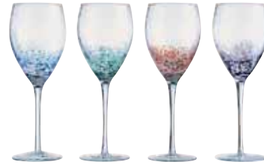
Wine Glasses - Set of 4