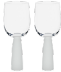
Wine Glasses Frost - Set of 2 3x3x8" / 10.25 oz ASD10391