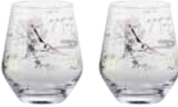
DOF Tumblers / Stemless Wine Glasses - Set of 2 3.5x3.5x4.25" / 17 oz ASD10077