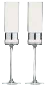
Champagne Flutes Silver - Set of 2