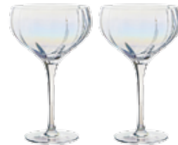
Champagne Coupes - Set of 2 4.25×4.25×7" / 13.5 oz ASD10301