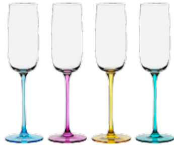
Champagne Flutes - Set of 4