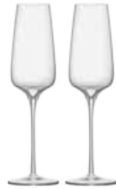
Champagne Flutes - Set of 2 2.25x2.25x9.5" / 8.5oz ASD10413