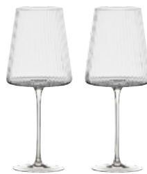
Wine Glasses Clear - Set of 2