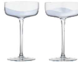
Champagne Coupes Silver - Set of 2 4×4×6.5" / 8.5 oz ASD10405