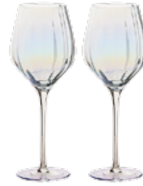
Wine Glasses - Set of 2 3.75×3.75×10.25" / 20.25 oz ASD10299