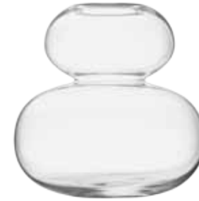
Eclipse Vase 9.75×9.75×9.5" ASD10225