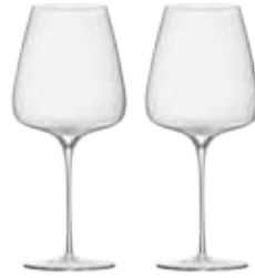
Red Wine Glasses - Set of 2 4x4x8.75" / 20.25oz ASD10414