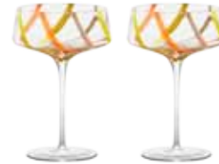
Champagne Coupes Citrus - Set of 2 4.25x4.25x6" / 10oz ASD10216