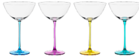
Cocktail Glasses - Set of 4