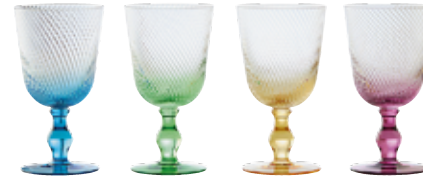
Wine Glasses - Set of 4 3.5x3.5x6.75" / 15.25 oz ASD10004