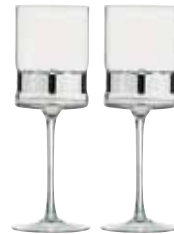
Wine Glasses Silver - Set of 2