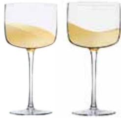
Gin Glasses Gold - Set of 2 3.75×3.75×7.75" / 18.5 oz ASD10397