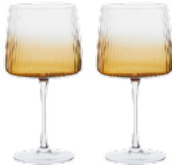
Gin Glasses Amber - Set of 2