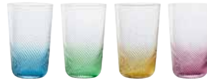
Highball Tumblers - Set of 4 3.5x3.5x5.5" / 18.5 oz ASD10006