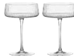
Champagne Coupes Clear - Set of 2