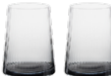
DOF Tumblers Smoke - Set of 2