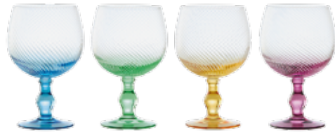
Gin Glasses - Set of 4 4.75x4.75x6.75" / 23.75 oz ASD10005