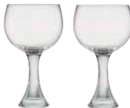
Gin Glasses - Set of 2