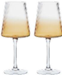
Wine Glasses Amber - Set of 2