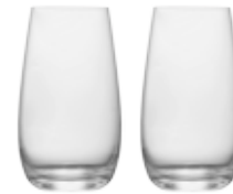
Highball Tumblers - Set of 2 3.25x3.25x5.75" / 18.5oz ASD10418