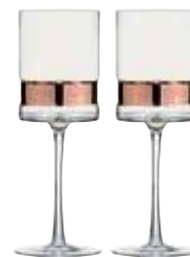
Wine Glasses Bronze - Set of 2