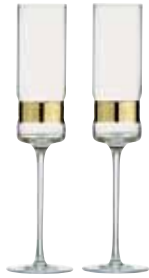
Champagne Flutes Gold - Set of 2