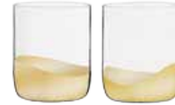
DOF Tumblers Gold - Set of 2 3.25×3.25×3.75" / 13.5 oz ASD10399