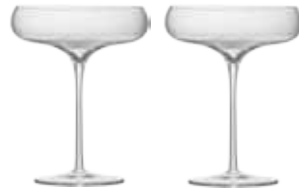
Champagne Coupes - Set of 2 4.75x4.75x6.25" / 10oz ASD10417