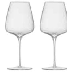
White Wine Glasses - Set of 2 3.5x3.5x8.25" / 15.25oz ASD10415