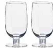
Highball Tumblers - Set of 2 2.75×2.75×6" / 15.25 oz ASD10126