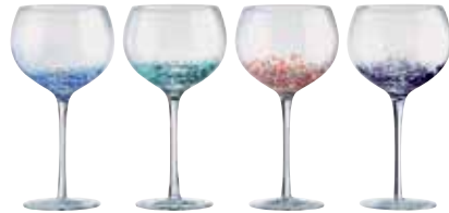
Gin Glasses - Set of 4