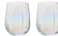
DOF Tumblers / Stemless Wine Glasses - Set of 2 3.5×3.5×4.5" / 15.25 oz ASD10302