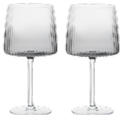
Gin Glasses Smoke - Set of 2