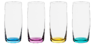
Highball Tumblers - Set of 4