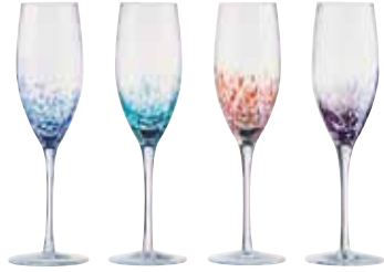
Champagne Flutes - Set of 4