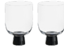
DOF Tumblers Black - Set of 2 3x3x4.5" / 10.25 oz ASD10385