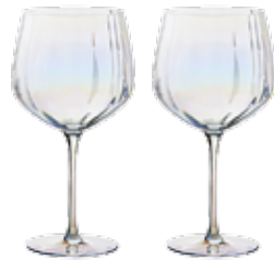
Gin Glasses - Set of 2 4.5×4.5×8.5" / 25.25 oz ASD10300