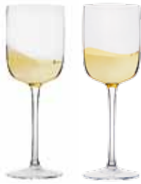
Wine Glasses Gold - Set of 2 3×3×8.5" / 13.5 oz ASD10396