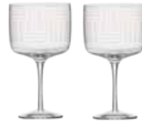
Gin Glasses - Set of 2 4×4×6.75" / 15.25oz ASD10196